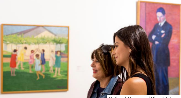
National Museum of Visual Arts

One of the most typical places of Montevideo, truly a 'flea market' with a centenary tradition -it was opened in 1909- it has become a sort of ritual both for Montevideo dwellers and tourists. It features an offer of items as ample and rich as extravagant: fruit and vegetables coexist with books, disks, antiquities, collectibles, decorative items, art crafts, and all imaginable stuff. It starts at Tristán Narvaja St. and 18 de Julio Ave., and extends across several blocks. Open on Sundays, from 9 am to around 4 pm.